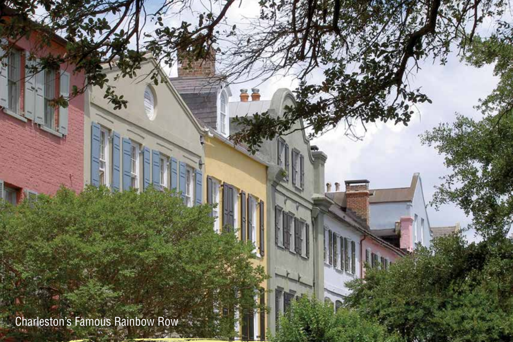
Charleston's Famous Rainbow Row