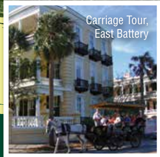
Carriage Tour, East Battery